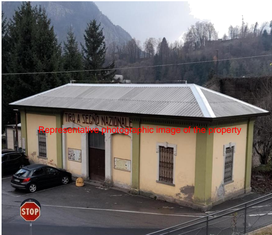
Representative photographic image of the property

Piazza Brembana (BG), Via Mamma Calvi no.32